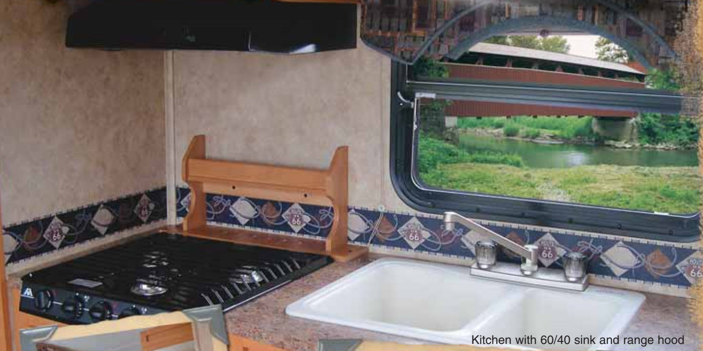
Kitchen with 60/40 sink and range hood