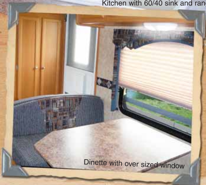
Dinette with over sized window