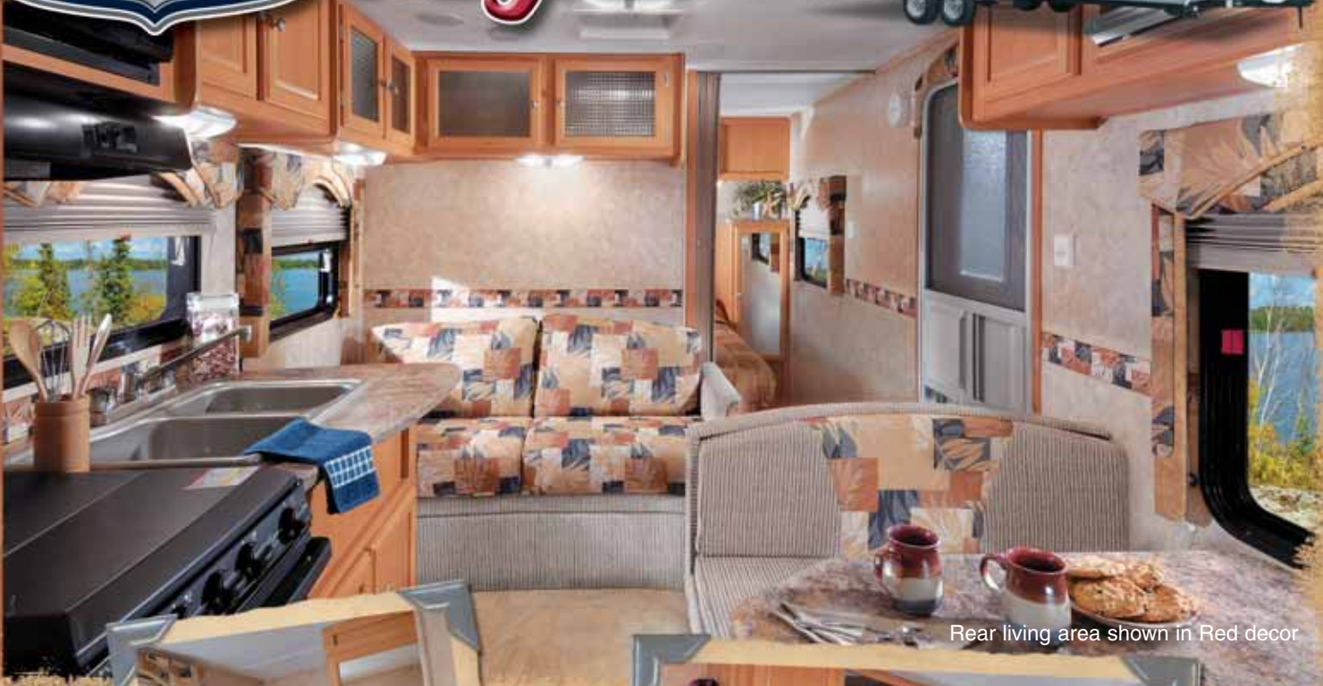
Rear living area shown in Red decor