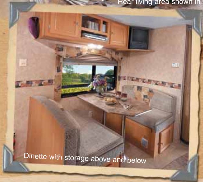
Dinette with storage above and below