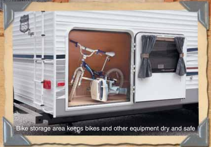
Bike storage area keeps bikes and other equipment dry and safe