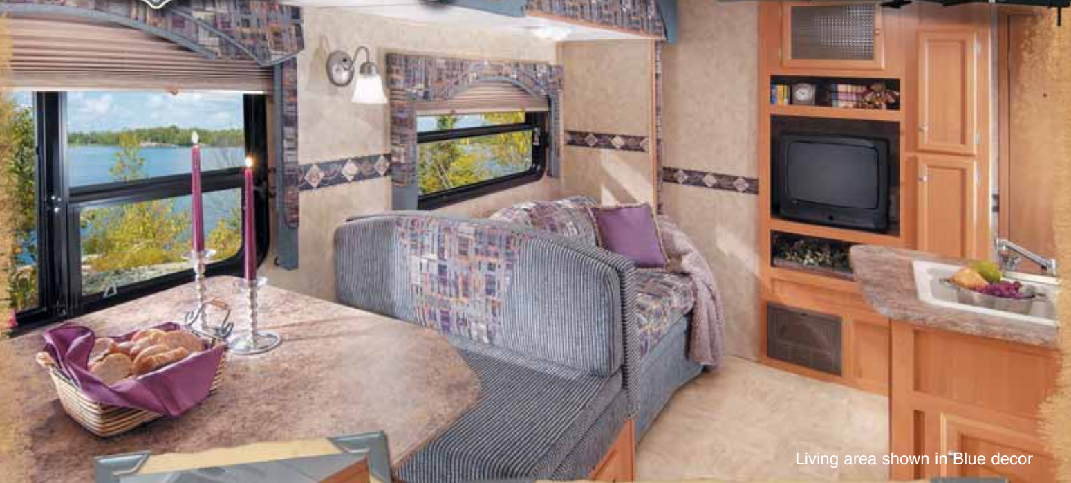
Living area shown in "Blue" decor